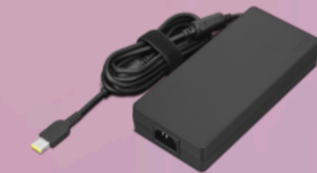
ThinkStation Slim 330W AC Adapter (Slim tip)-TW 4X21U34362

Please click here to view the full list of accessories.