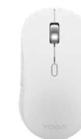
Lenovo Yoga Bluetooth Silent Mouse (Seashell, W/O Battery) GY51S61927