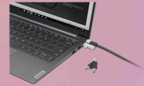
NanoSaver Cable Lock from Lenovo 4XE1L51710