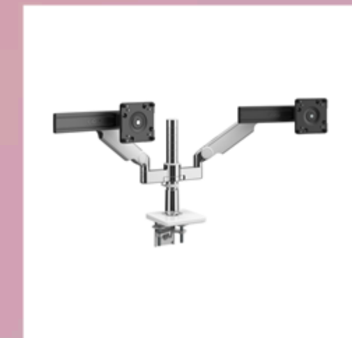
Humanscale Dual Monitor Arm White 4ZE1U10767