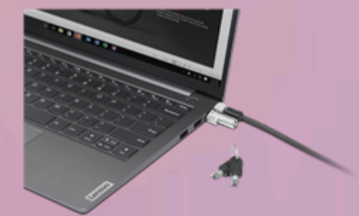
NanoSaver Cable Lock from Lenovo 4XE1L51710

Please click here to view the full list of accessories.