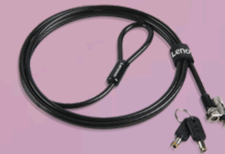
Kensington MicroSaver DS 2.0 Cable Lock from Lenovo 4XE1L68273

Please click here to view the full list of accessories.