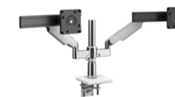
Humanscale Arm for dual monitor configuration, polished aluminum with whit...