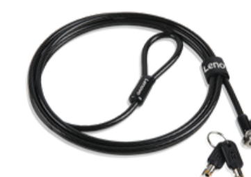
Kensington MicroSaver DS 2.0 Cable Lock from Lenovo