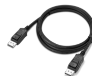
Lenovo DisplayPort to DisplayPort 1.4 cable 1.8m